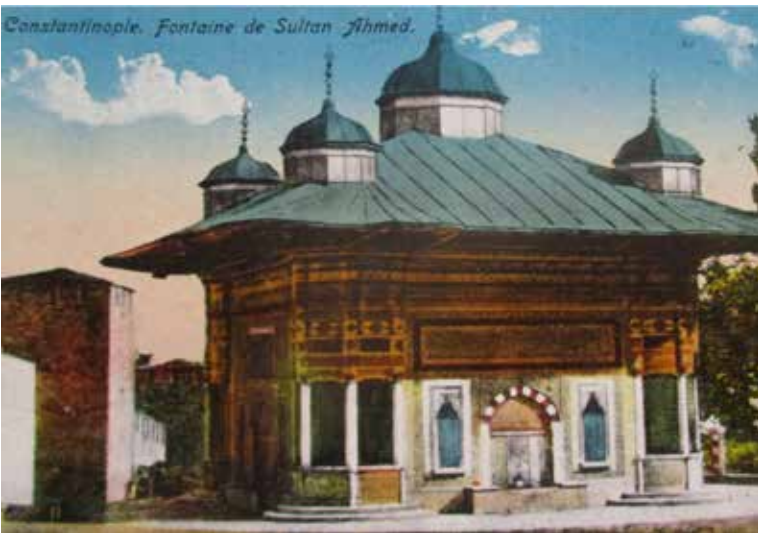
Fountain of Sultan Ahmet III (built 1728) on an historical postcard.

the court and the elites. Water supply, with its ideological scaffolding based in Islamic philanthropy, had offered the Ottoman ruling elite the opportunity to showcase their care for the well-being of the subjects, and had crystallized the hierarchies of power within the court.