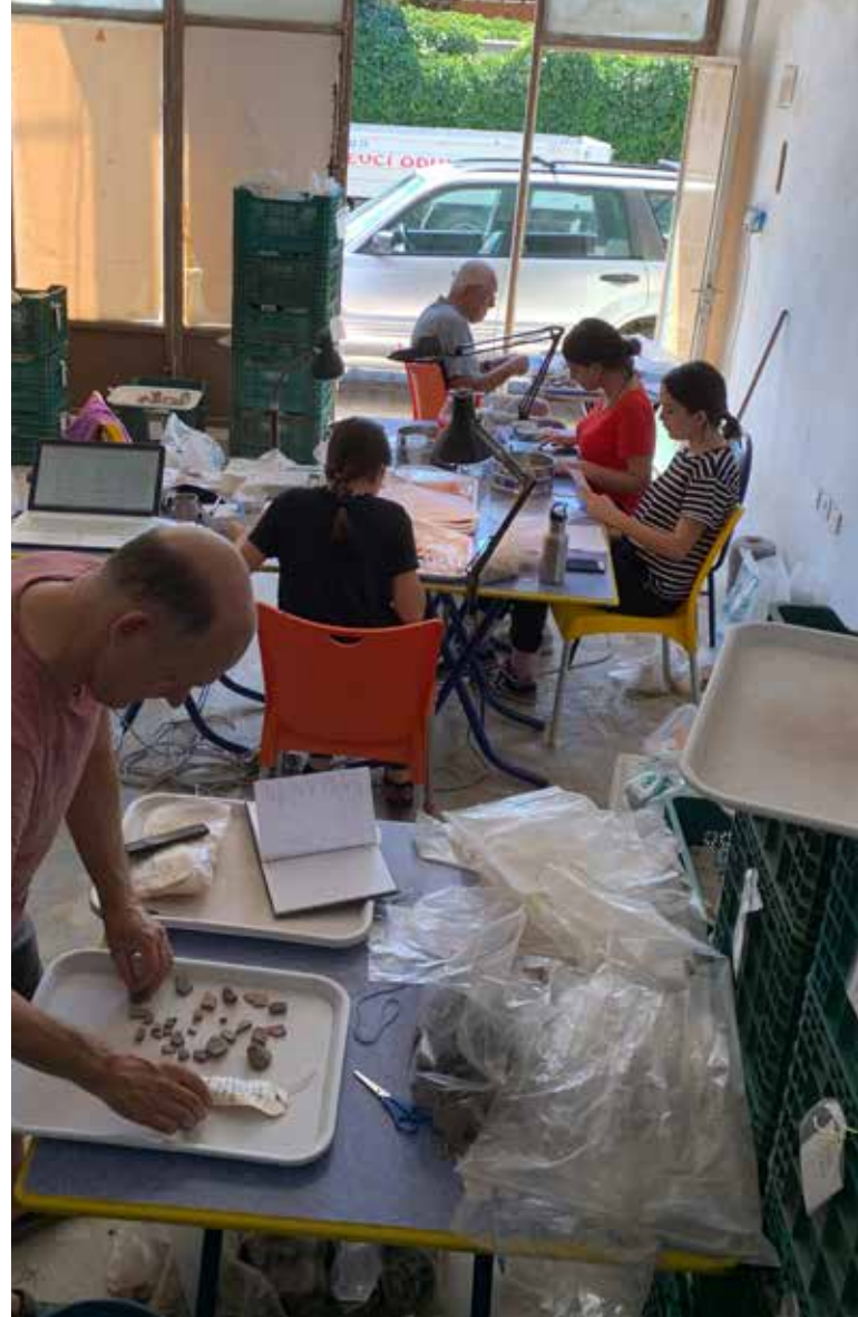
Working on the finds from the Barcın Höyük excavations.