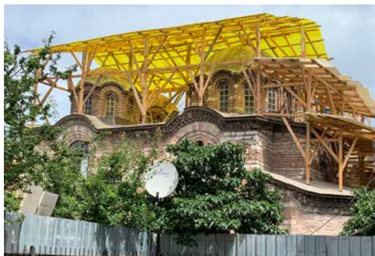
Fethiye Camii/Pammakaristos Church under a protective roof during the restoration process.

NIT Research Fellow Mariëtte Verhoeven has been studying the Fethiye Camii/ Church of Pammakaristos since 2015. She investigates the built fabric in its current state, including decoration, liturgical objects, and inscriptions. Moreover, she surveys the historical data to establish which of the surviving parts of the building belong to which construction or restoration phase. A further aim of the project is to expose the memories and meanings that are attached to the building by different groups that engage(d) with it.