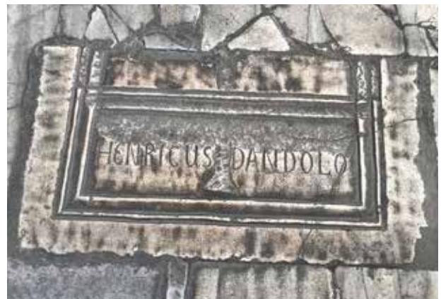
The alleged grave stone of Dandolo, now set into the floor of the Hagia Sophia.