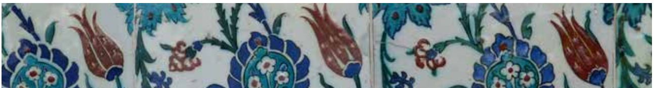
Image front page, page 2 and below: ceramic tiles at Topkapı Palace.

Except where mentioned otherwise, all texts written by Fokke Gerritsen, Ülker Sözen and Ceren Abi.