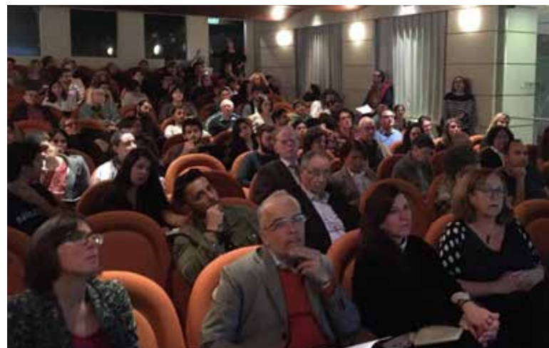
A full house for the Beyoğlu event. Beyoğlu is also the Istanbul neighborhood where NIT is located.