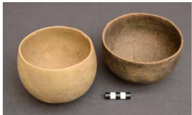
Two ceramic bowls found in the Barcın Höyük excavations (c. 6200 BCE).

In 2019, a major step was made in this respect with the inclusion of the Barcın Höyük digital archive in a project of the Vrije Universiteit Amsterdam. This offers a research data management platform called Yoda (‘your data’) that allows researchers to work together on centrally stored dynamic datasets. Moreover, at a future stage, it will be possible to make these datasets generally accessible in line with the so-called FAIR principles for research data: Findable, Accessible, Interoperable and Reusable.