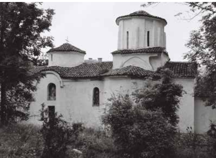
Tryn (Bulgaria), Church of the Archangel, late 16th century, photographed by Machiel Kiel in 1969.