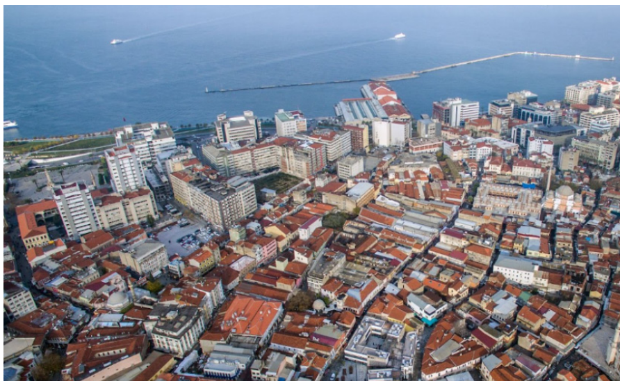
Aerial View: Izmir Historical Port City.

Izmir, situated at the edge of a sheltered gulf and surrounded by mountains, has long served as a hub connecting diverse regions with its transportation network. Its history dates back to the Hellenistic period, with continuous settlement since the late 4th century BCE. Archaeological excavations revealed its significance as a trading nexus, evidenced by the Smyrna Agora's archaeological remains and graffiti detailing daily life. Especially during its heyday as part of the Euro-Asian Silk